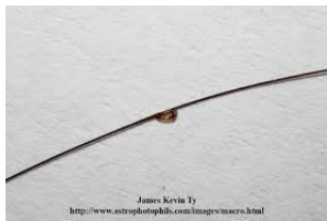
Head Lice 'nit' or 'egg' attached to hair

Studies have shown that head lice inspection programs and school exclusion policies are ineffective and unnecessary. At Juniper Ridge Elementary we believe that education and cooperation is the key. Head lice are not a health hazard or a sign of uncleanliness and are not responsible for the spread of any disease. They are the cause of much embarrassment and misunderstanding. Please take some time to review this brochure as well as School District No.73 Policy on the school website.